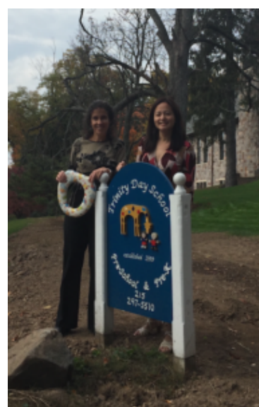
At Trinity day

A shout out to Trinity Day School in Solebury, PA where we spoke with a group of parents yesterday about the pearls and pitfalls of potty training. Today we share some of what we discussed.