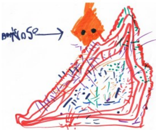
Ben's runny nose, as depicted by Ben

The good news is that there was only a smattering of influenza (flu) cases across the United States over the summer. The great news is that according to the Centers for Disease Control, most of the detected strains are covered in this year's vaccine.