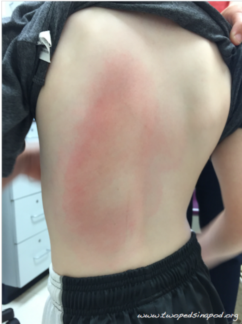
The classic bullseye rash of Lyme

Just like last year, experts are predicting more Lyme disease. While it used to be a pesky disease only in our midatlantic/Lyme Connecticut area of the world, Lyme continues to appear across the northeast and has been reported on the west coast of the United States. According to the American Academy of Pediatric's Redbook, about fifty percent of reported Lyme disease is during June and July. We've already had children come to our office with tick bites concerns, so here's an update: