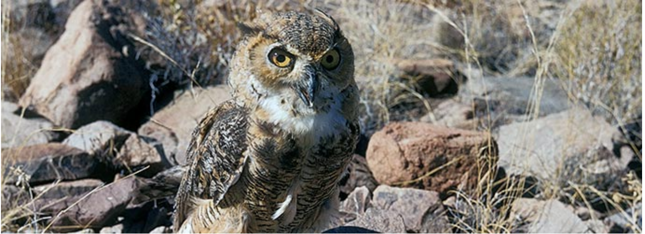
Great-horned owl, NPS Photo, Big Bend National Park

Okay, we admit it: our kids are still in their summertime sleep mode of stay up late/sleep late. With school starting soon, many of us now have to shift our children from summer to school year sleep schedules. Because school start times are constant (and early), the kids will have an easier time if you help them shift their bedtimes gradually over the period of a week or two toward the desired earlier bedtime. Remember, the average school-aged child needs 10-11 hours of sleep at night and even teenagers function optimally with 9-10 hours of slumber per night.