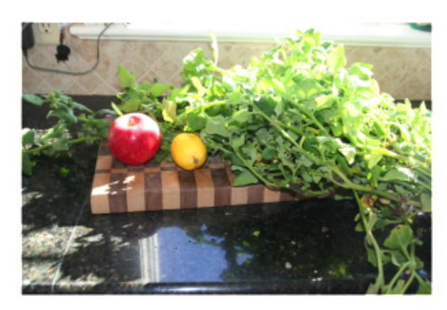
New Zealand Spinach

harder to grow, given its attractiveness to the cabbage loper caterpillar, one of my garden nemeses. Vigilance and a few tricks can help you! We purchase praying mantis egg cases and lacewing insect eggs from online stores such as Gardens Alive. These beneficial insects will eat the cabbage loper caterpillar. In addition, finding the green worms on the back of the leaves and hand crushing them depletes their population.