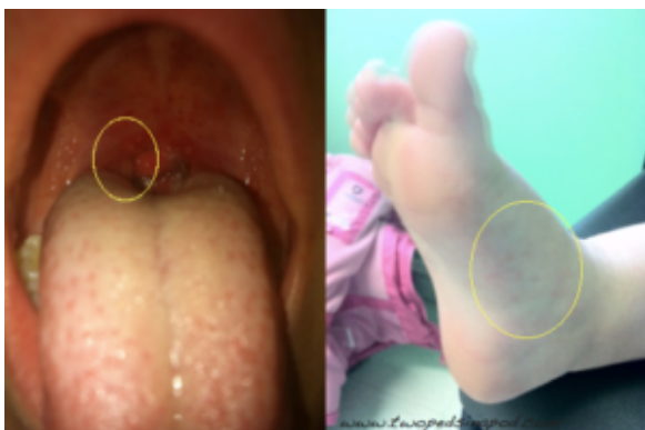
The mouth ulcers and foot rash of Hand Foot Mouth

Hand-foot-mouth disease- not an automatic exclusion