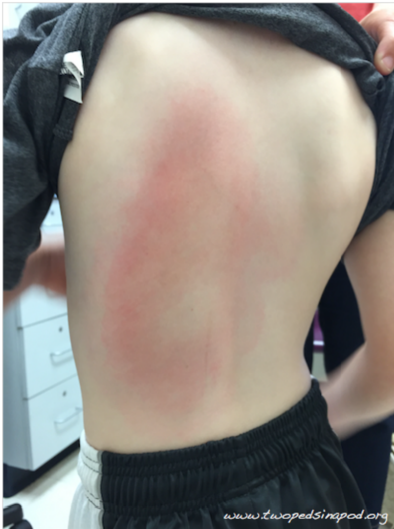
The classic bullseye rash of Lyme

Our infectious disease colleagues warn us that this year, winter in the Northeast United States was not cold enough for long enough to kill off as many ticks as usual. Thus, we folks in Pennsylvania are in for a more burdensome Lyme disease season. We've already had children come to our office this