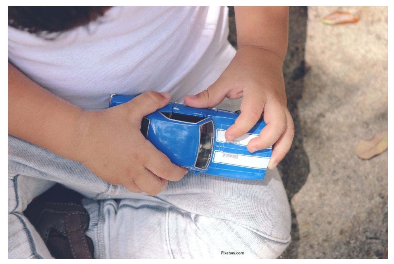
Car seat safety isn't just child's play.

Just in time for families who plan to drive to Labor Day Weekend destinations, the American Academy of Pediatrics updated their car seat safety recommendations.